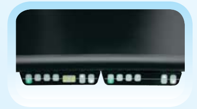
Keypad to adjust surface height electronically with LED display and 4 preset memory