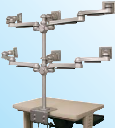
Clamp Mount Monitor Arm for six monitors # AFC2100-06