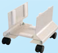
Leg Mount CPU Cradle # CPU-07

Complete line of Accessories available! 1.800.984.3135