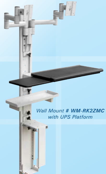
Wall Mount # WM-RK2ZMC with UPS Platform